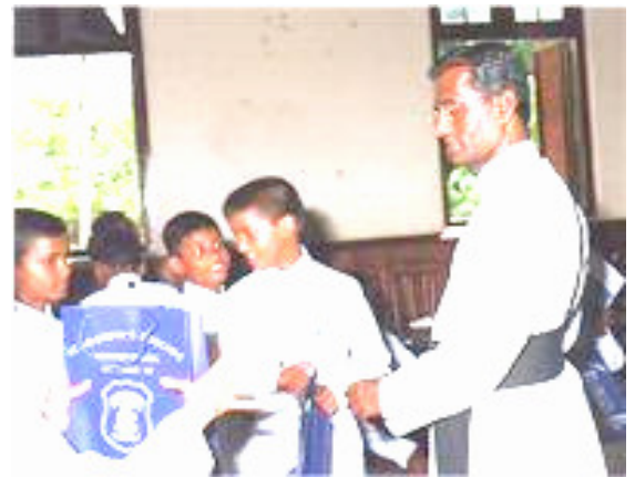
Rev. Fr. Rector with a few Josephian First Holy Communicants.